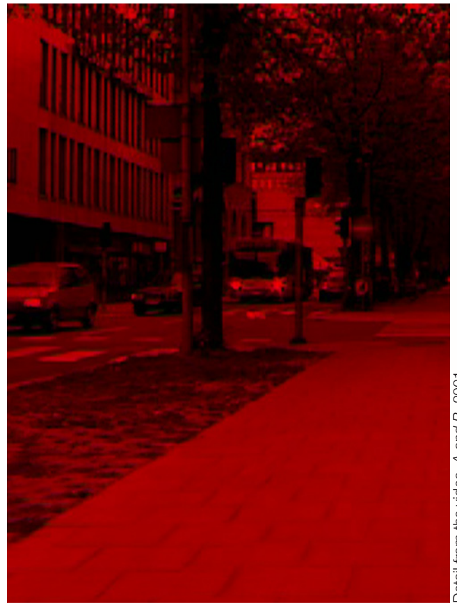
Detail from the video A and B 2001