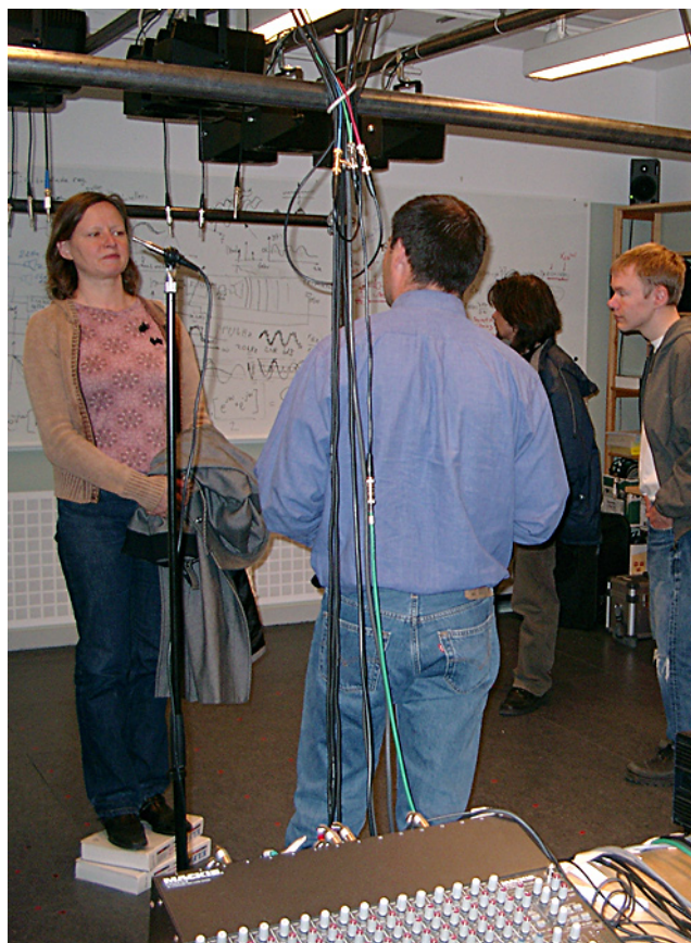
Tyst ljudskulptur 2001-2003 http://cid.nada.kth.se/tystljud