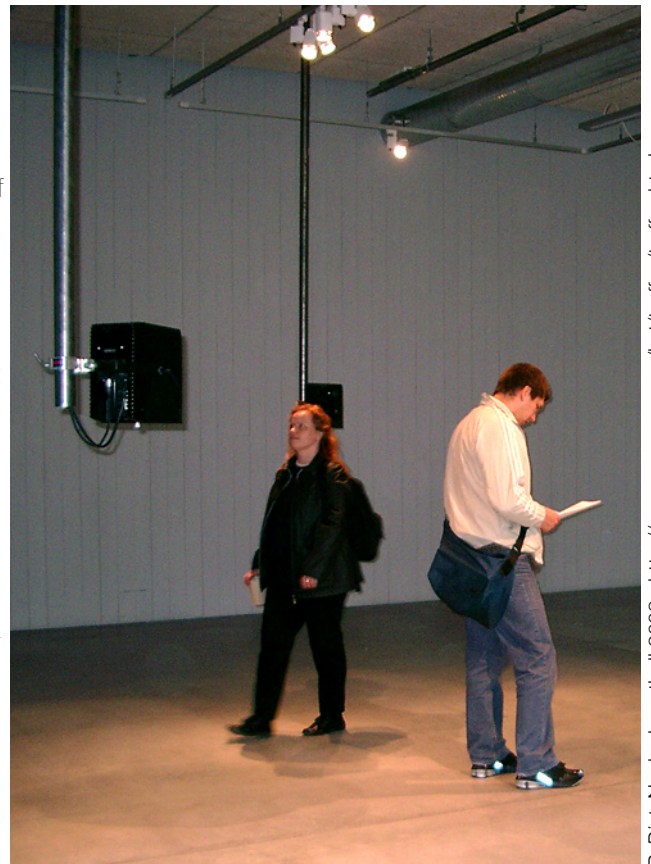
D-Dist Nacka konsthall 2003 http://www.annrosen.nu/hv/traffas/traffas.html