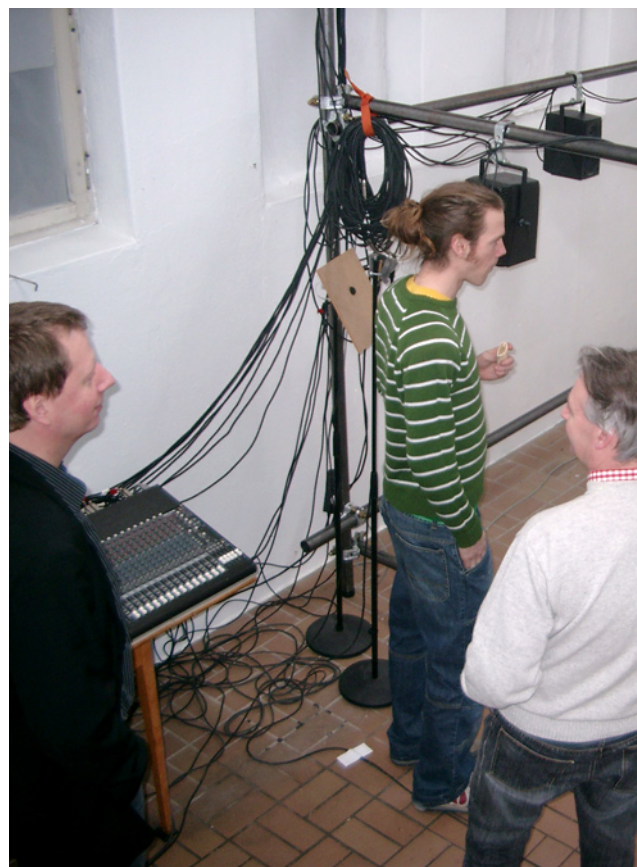
Rumsliga tystnader Nacka i februari 2005