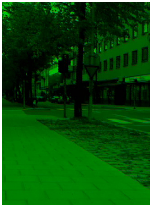
Detail from the video A and B 2001