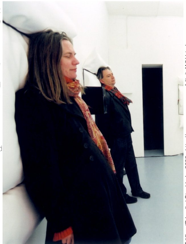
Träffas ID:1 galleri Stockholm 2002 http://www.annrosen.nu/iditr/trANN.html

One example of these collaborations is a series of videos with the collective title Vardagssekvenser (Everyday sequences). It consists of short episodes from a few people's everyday life. In all the sequences the camera functions simply as a recorder, a register; none of the material is dramatized. The material collected with the camera is structured according to a concept, and the person who is filmed gets to choose the situation. The sequences are filmed in one take without any explanation to where we are or any background