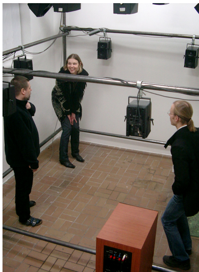
Rumsliga tystnader Nacka 2005