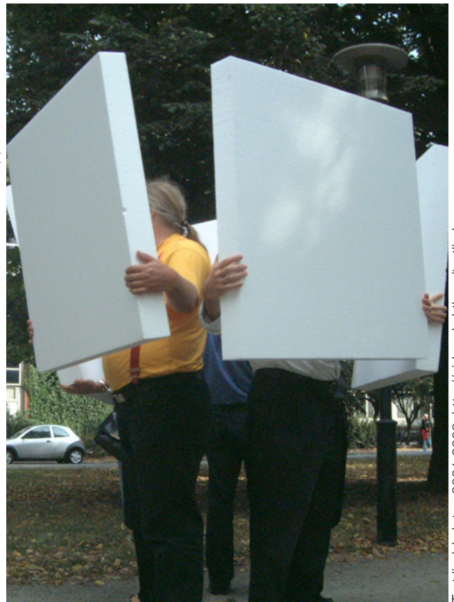
Tyst ljudskulptur 2001-2003 http://cid.mada.kth.se/tystljud