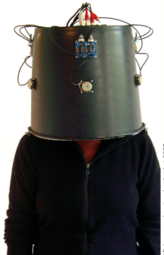
Mini surround system in a bucket 2005

My hope is that this exhibition and the program, based on my artistic work from 2000 to 2005, can contribute to the development of discussions between different groups, actors from different fields of interest. I hope that the exhibition can become a meeting point and create opportunities for a dialogue to begin.