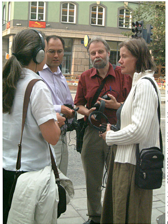
Tyst ljudskulptur 2001-2003 http://cid.nada.kth.se/tystljud