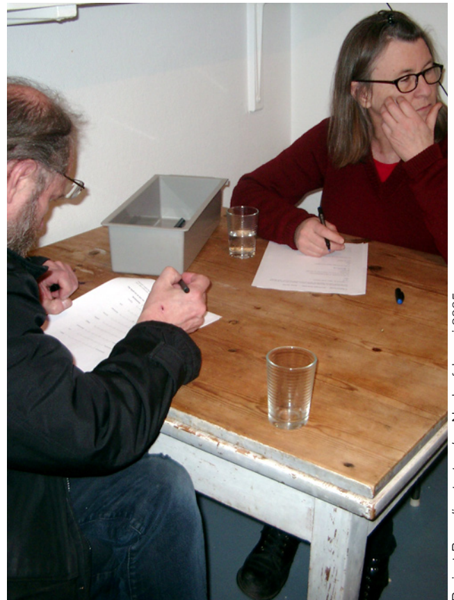
Project Rumsliga tystnader Nacka februari 2005

Our socio-cultural milieu is perhaps the greatest determinant of our individual subjectivities, in terms of our relationships to the members of our families and to the wider network of individuals who constitute our society. In our world language and other forms of symbolic communication (such as music or religious behaviours) structure and direct our ideas and actions. With great insight the French psychoanalyst and thinker Jacques Lacan pointed out that none of us ever really speak our own language - the language that we speak exists before we do, the symbolic systems that determine social position, gender, even something as personal as our "own" names, are decided in advance of our individual existence. In light of this the almost paranoid insistence of an autonomous "art pour l'art" can be read as a reactionary denial of the anxiety