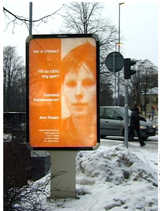
Har vi träffats? Gävle 2001

Så kanske handlar det om påverkan. Att påverka en nära kollektiv miljö för att urskilja individerna, eftersom individen alltid är den viktigaste enskilda beståndsdel. Eller är det tvärtom, att kollektivet är den första och