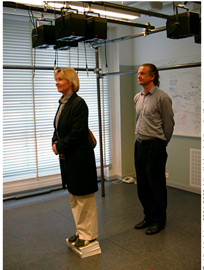
Tyst ljudskulptur 2001-2003 http://cid.nada.kth.se/tystljud