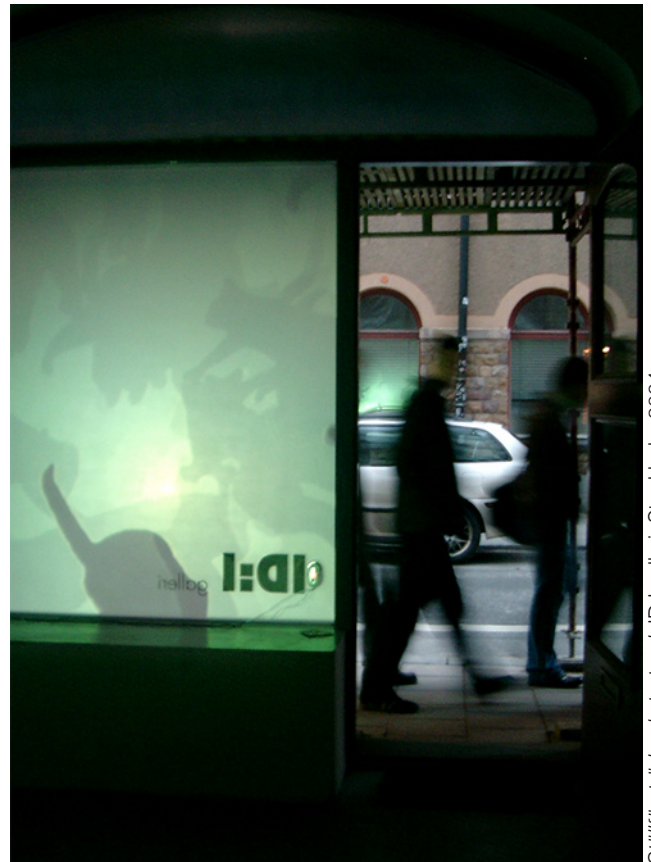
Ställföretredande tystnad ID:! galleri Stockholm 2004

For Lacan "loss" is one of the foundational experiences in the formation of our subjectivity. It is loss, of the